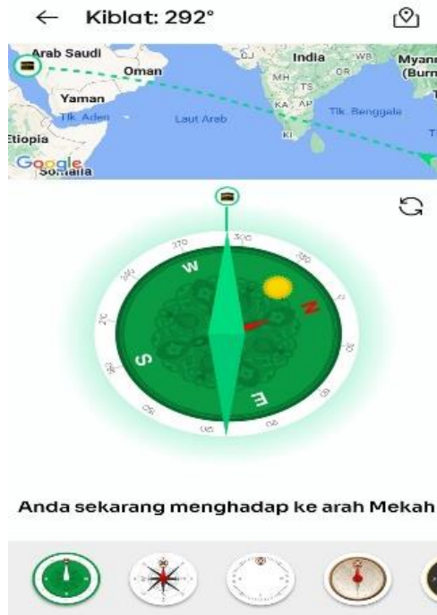
Picture 1. Qibla Platform