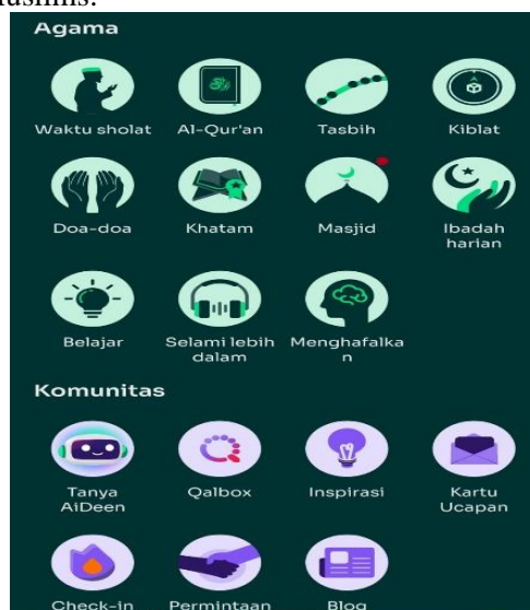
Picture 3. Menu of Muslim Pro Application

In daily religious practices, users of the Muslim Pro Application often seek guidance on worship procedures such as how to perform prayers, fasting, zakat, and hajj. Literature studies show that the Muslim Pro Application can provide fairly complete and accurate guidance on these worship procedures. The information provided tends to be in accordance with Islamic teachings generally accepted by the majority of Muslims.