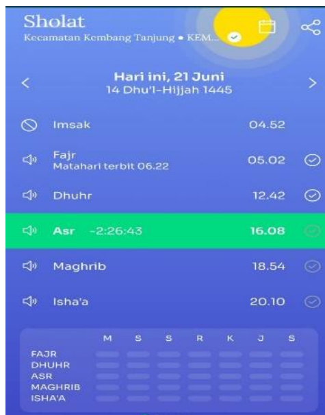
Picture 2. Prayer Platform